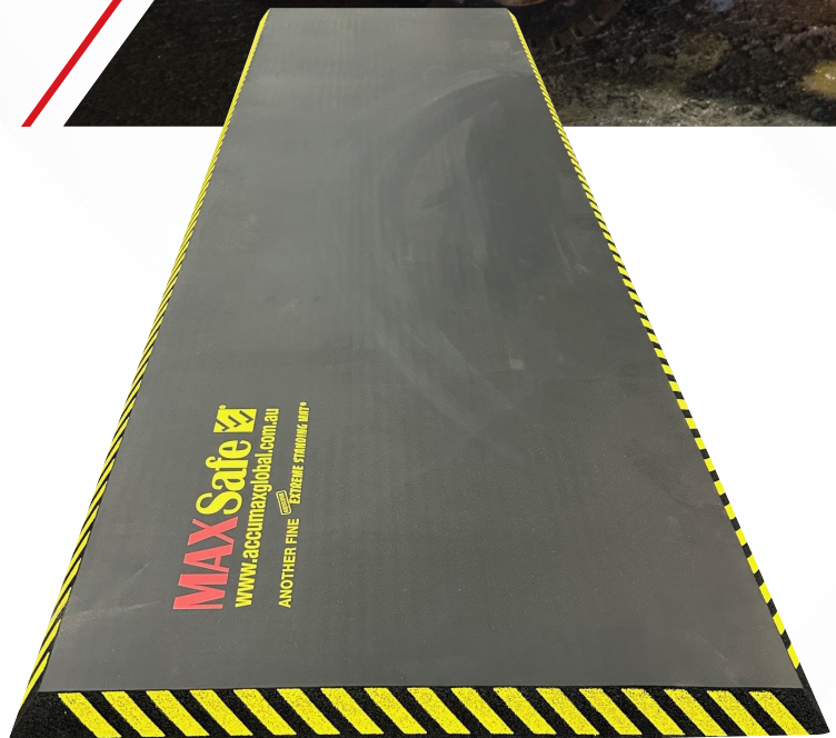
Double Boom Jumbo Deck

The MaxSafe Anti-Vibration Standing Mat has been designed specifically to snugly fit the Single and Double Boom Jumbo Decks, another example of an innovative product from the team at Accumax.