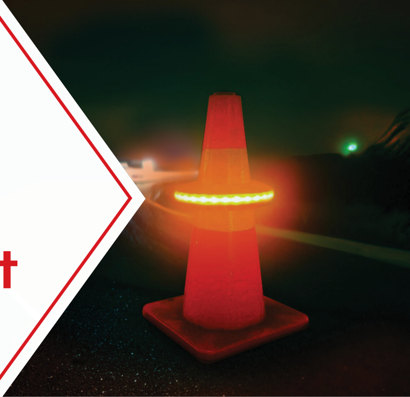
Image shows Amber light.

Illuminate safety standards with our safety lights designed to enhance the visibility of traffic cones. Suited to a range of environments, the lights are perfect for nightworks and sites that can pose a danger if accessed incorrectly. For use as a simple wayfinding solution to warning of danger on construction, mining and civil sites the lights are a valuable safety solution.