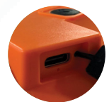
C/w USB Charger Cable