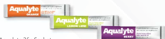
Aqualyte 25g Sachet