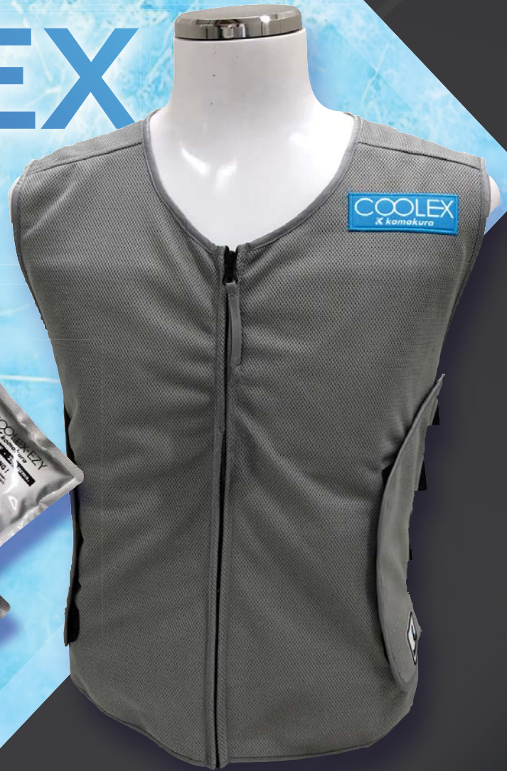
COOLEX EZY Vest with 8 Gel Pouches