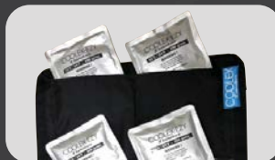
COOLEX EZY Seat Cover with 8 Gel Pouches