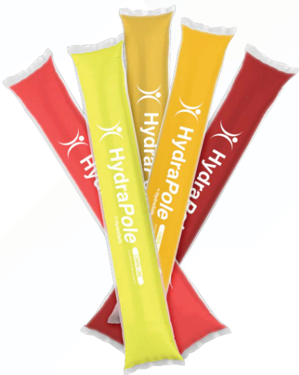
Our Ice Poles are an Australian made, 100% all-natural electrolyte replacement powdered Ice Pole.