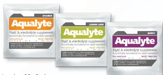
Aqualyte 80g Sachet