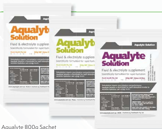
Aqualyte 800g Sachet