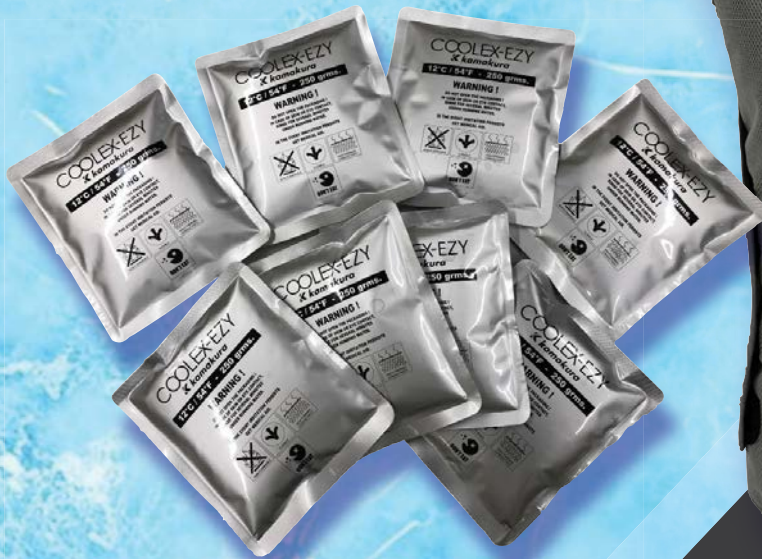
COOLEX EZY - 8 Gel Pouches