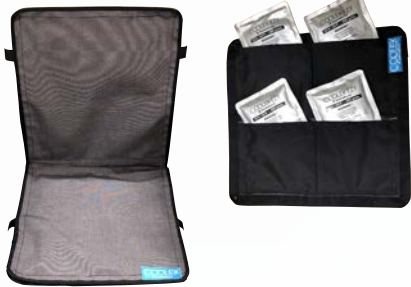
COOLEX EZY Seat Cover with 8 Gel Pouches