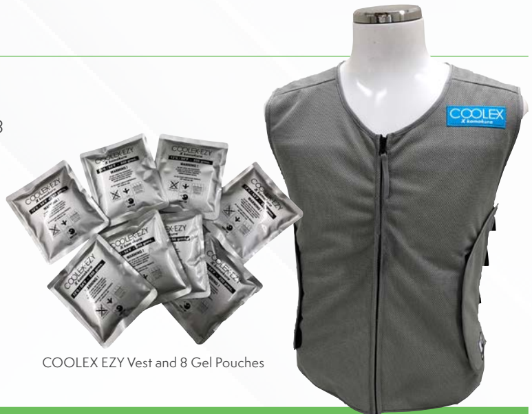
COOLEX EZY Vest and 8 Gel Pouches

Ideal for temporary situations, the versatile vests can be used in many applications. The vests and seat cover are machine washable with adjustable straps for better comfort and fit.