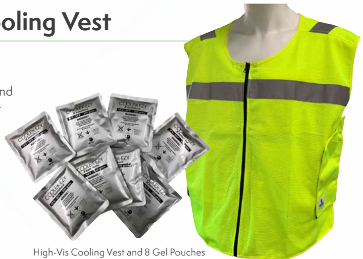
High-Vis Cooling Vest and 8 Gel Pouches

We have listened to our customers' needs and worked to provide them with a product to suit their requirements.