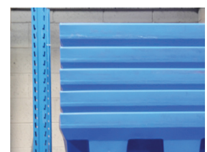
Nestable for transport