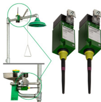
PRODUCT CODE: EU-9003N

This series is especially beneficial for remote monitoring applications where wiring or wire maintenance is not physically possible or economically feasible. Combining this greater flexibility with proven harsh-duty packaging can result in increased efficiencies and improved safety for machines, equipment, OEMS, and operators.