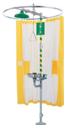
PRODUCT CODE: AM-9037 with Tyvek liner