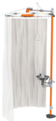
PRODUCT CODE: AM-AP250-015