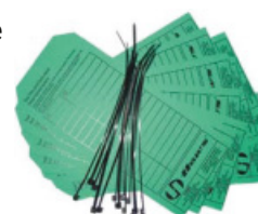
PRODUCT CODE: AM-SP170