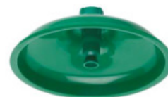
PRODUCT CODE: AM-SP829

AXION® MSR ABS plastic emergency showerhead with integral 75.7 L flow control.